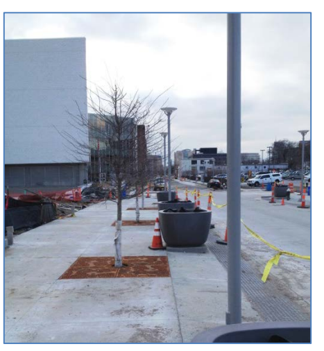
Starting to take shape . . . views west and south from Duncan at the Commons.