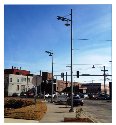
Some of the new lighting installed along Boyle north of Clayton.